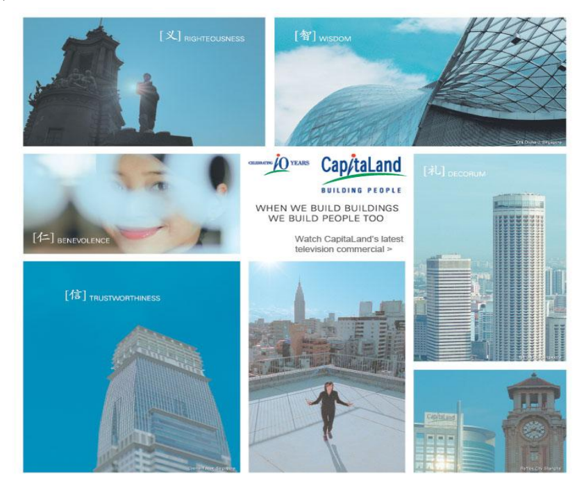
Figure 1. CapitaLand TVC 2010: We build people too

At CapitaLand we take the same approach to building the two because we understand when we build buildings, we build people too. (CapitaLand TVC script, 2010)